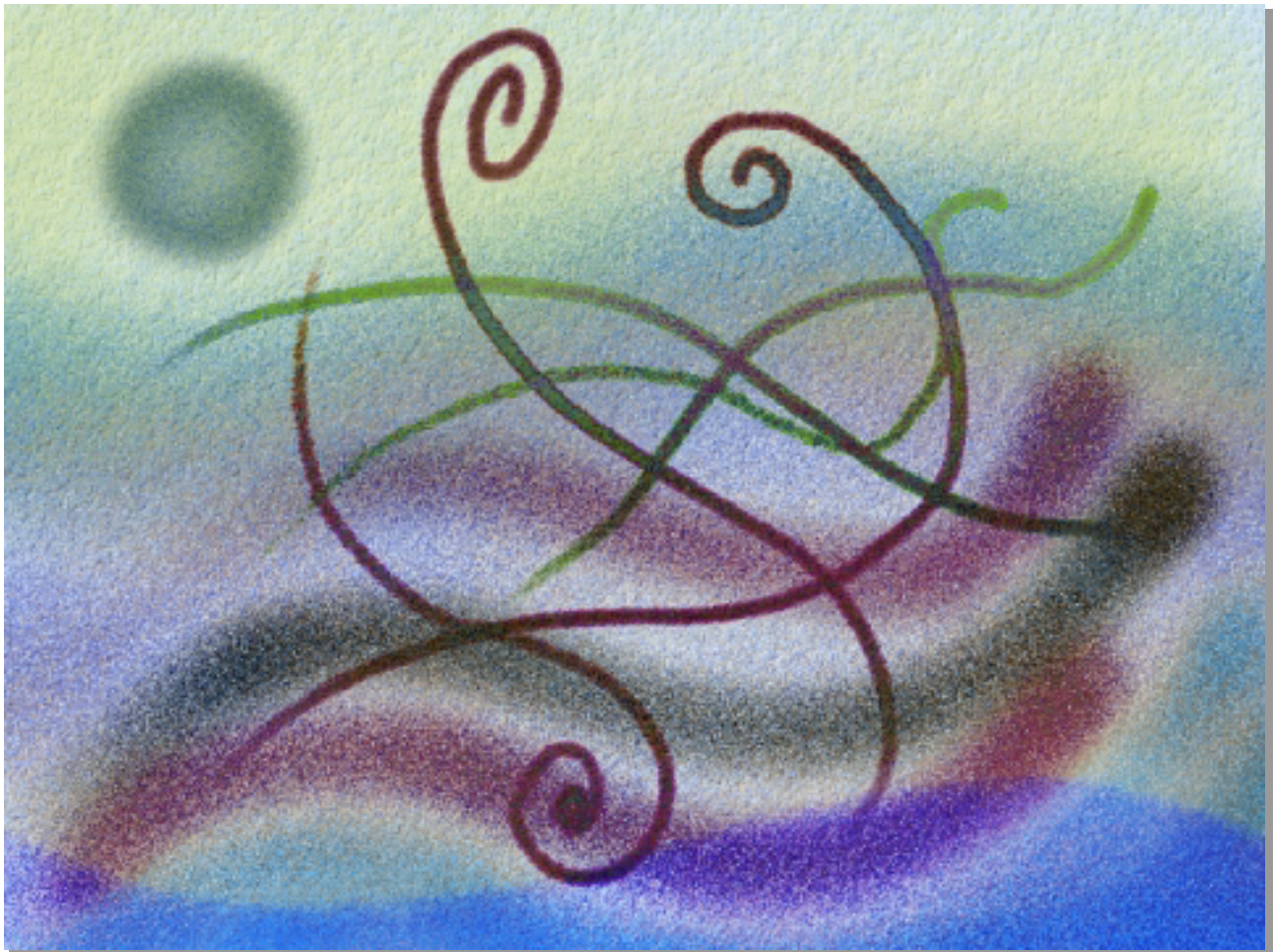
Sargasso Sea, 2001

For details, visit www.mbio.ncsu.edu/MJC